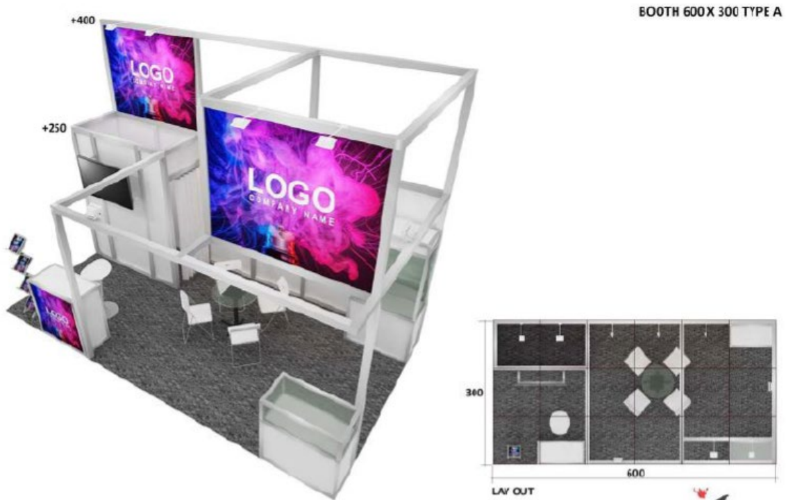
BOOTH 600X 300 TYPE A