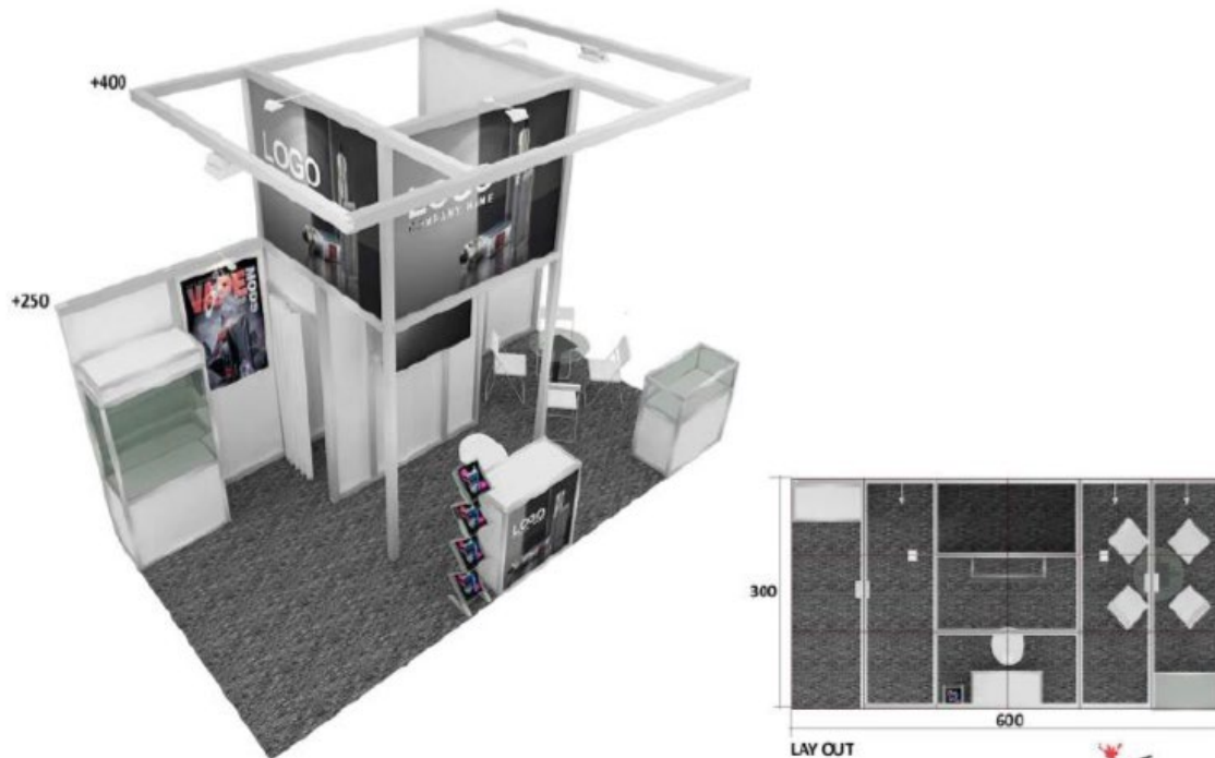
BOOTH 600 X 300 TYPE C